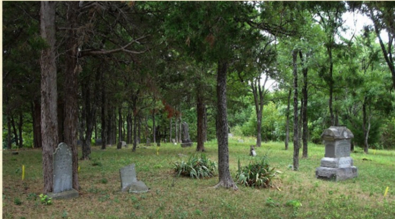
Pictured: Orenduff Cemetery ca. 2008.

You are cordially invited to join us for the Texas Historical Marker dedication ceremony for