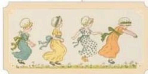
Illustration ©1911 by Kate Greenaway.

The aesthetic movement in children's clothing, strongly influenced by children's author and illustrator Kate Greenaway, advocated for loose clothing for little girls so they'd be free to run, jump, and climb trees.