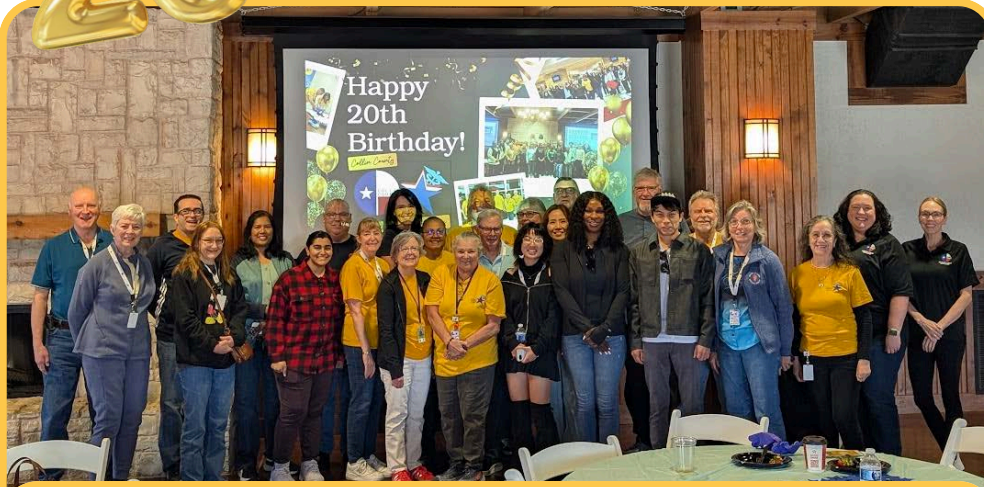
We enjoyed celebrating with all of you!

Collin County Medical Reserve Corps was founded on February 24, 2006.